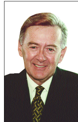
Preston Manning will be a keynote speaker at the conference.

The Ernest C. Manning Awards Foundation is teaming up with Canada’s top science writers to present a national science conference in Alberta this summer. With financial sponsorship from EnCana Corporation, the Manning Innovation Awards will be the Lead Conference Partner of this year’s Canadian Science Writers’ Association (CSWA) annual conference and Science in Society Journalism Awards ceremony, to be held in Jasper National Park.