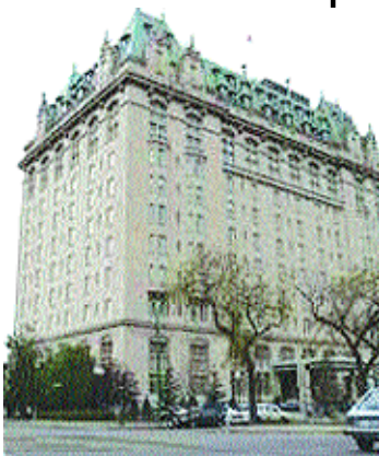
The Fort Garry Hotel

With the last two Awards Ceremonies held in Halifax and Vancouver respectively, Winnipeg will provide the link to recognizing our nation's most talented innovators.