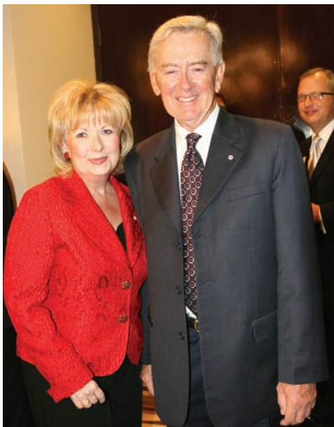
L – R: Honorary Co-Chairs of the Ernest C. Manning Awards Foundation Gala, The Honourable Pamela Wallin , Senate of Canada, Preston Manning , President and CEO, Manning Centre for Building Democracy