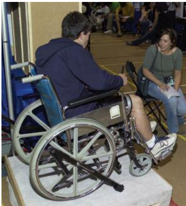
Demonstrating the Step-Climbing Wheelchair at the 2006 Canada-Wide Science Fair in Saguenay, Quebec.

“This award...served as a source of motivation and encouragement for me. The Award of Distinction recognized my work in creating awareness of the potential of people living with a spinal cord injury and related disabilities. I believe that the impacts of the Manning Innovation Awards will continue to benefit future generations and will leave lasting legacies.”